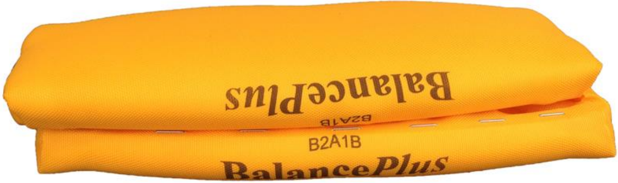
The Product Code is on the side of the pad stencilled on the fabric